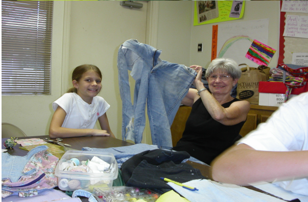
Members of College Community Church, MB transform used jeans into sturdy backpacks.